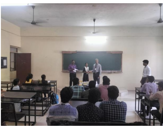
Fig: 7.2.1(17) Winners received awards and appreciation at Classroom