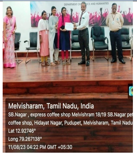
Fig: 7.2.1(11) Winners received awards and appreciation of Best Student Of The Year-2022'