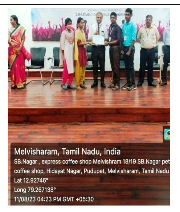
Fig: 7.2.1(9) Winners received awards and appreciation of Best Student Of The Year-2022'