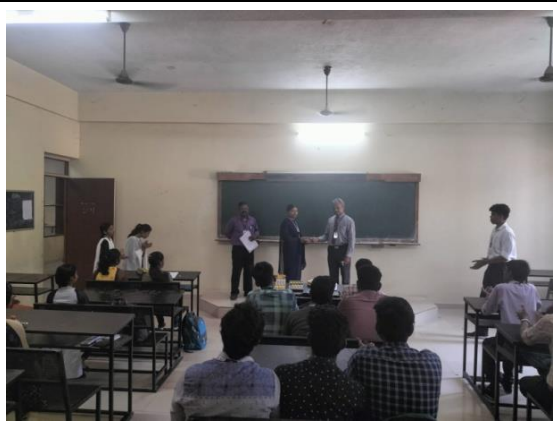
Fig: 7.2.1(14) Winners received awards and appreciation at Classroom

Internal Assessment Tests like as IAT-1, IAT-2 & MODEL Examinations for every Semester