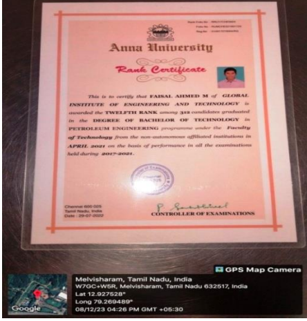
Fig: 7.2.1(26) Winners Appreciated & Received University Rank Holder Certificate