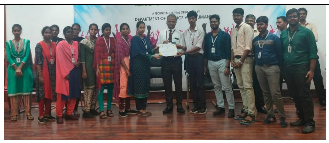
Fig: 7.2.1(23) Winners Appreciated & Received Certificate At Auditorium