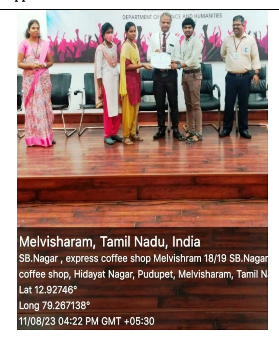
Fig: 7.2.1(12) Winners received awards and appreciation of Best Student Of The Year-2022'