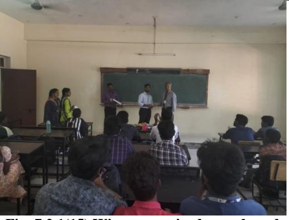
Fig: 7.2.1(15) Winners received awards and appreciation at Classroom