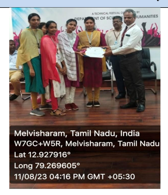
Fig: 7.2.1(6) Winners received awards and appreciation of Best Student Of The Year-2022'

Consolidated 100% Attendance for every Semester (ODD SEMESTER - BATCH:2022-23)