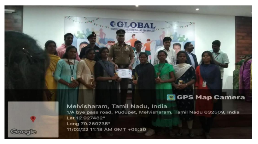
Fig: 7.2.1(4) Winners received appreciation certificates on the Sports Day

The college Sports club of Global Institute of Engineering and Technology's (GIT) organizes sports day week in the last week of February every year where several indoor and outdoor intracollegiate sports competitions are organized. The winning teams and individuals are awarded also appreciated with certificates for their achievements.