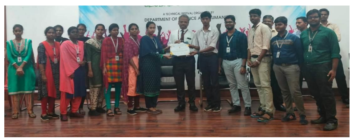
Fig: 7.2.1(22) Winners Appreciated & Received Certificate At Auditorium