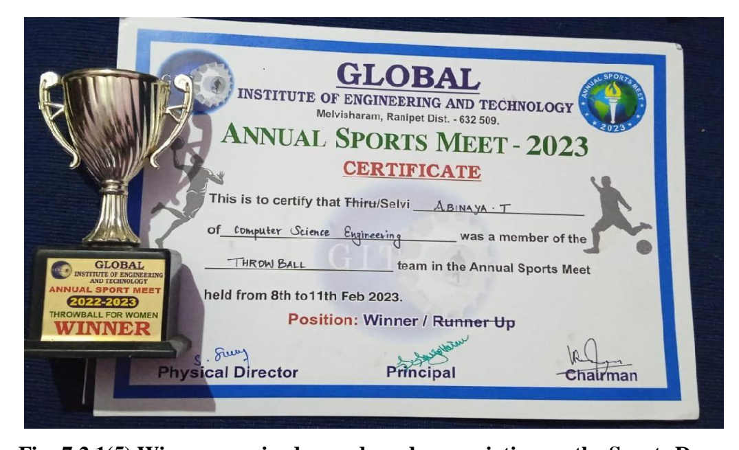
Fig: 7.2.1(5) Winners received awards and appreciation on the Sports Day