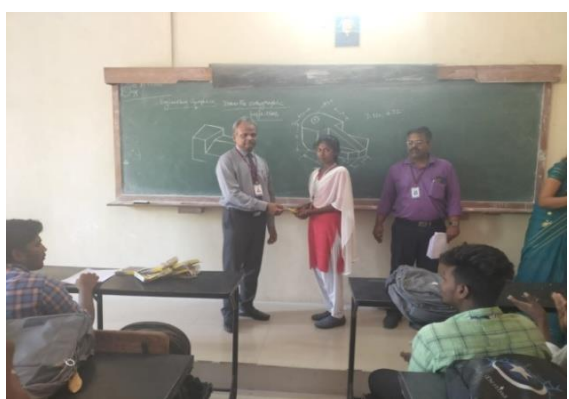
Fig: 7.2.1(18) Winners received awards and appreciation at Classroom