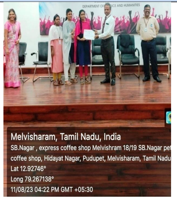
Fig: 7.2.1(7) Winners received awards and appreciation of Best Student Of The Year-2022'