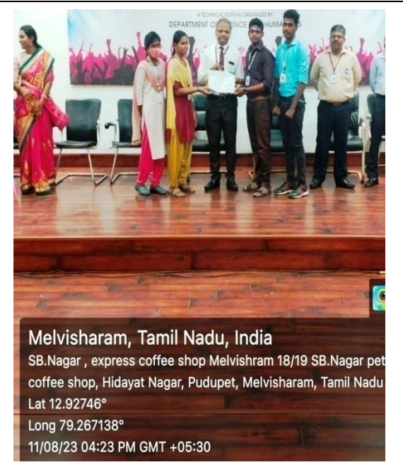
Fig: 7.2.1(13) Winners received awards and appreciation of Best Student Of The Year-2022'