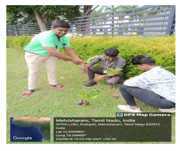
Fig: 7.2.1(1) Students plant the tree in campus Fig: 7.2.1(2) Each One Plant One at campus

The college is continuously committed to working towards a plastic-free campus, as per guidelines of the UGC to impose a ban on single-use plastics in higher educational institutions have been abided by our college. Single-use plastic items such as plastic bottles, bags, spoons, straws and cups are among the banned plastic products. It has been made applicable at the canteen, college premises and hostels. Staff and students are also advised to use metal water bottles instead of plastic ones. We mandate all students/staff members to avoid bringing non-biodegradable plastic items on the campus.