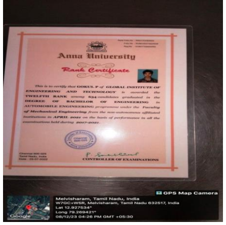
Fig: 7.2.1(27) Winners Appreciated & Received University Rank Holder Certificate