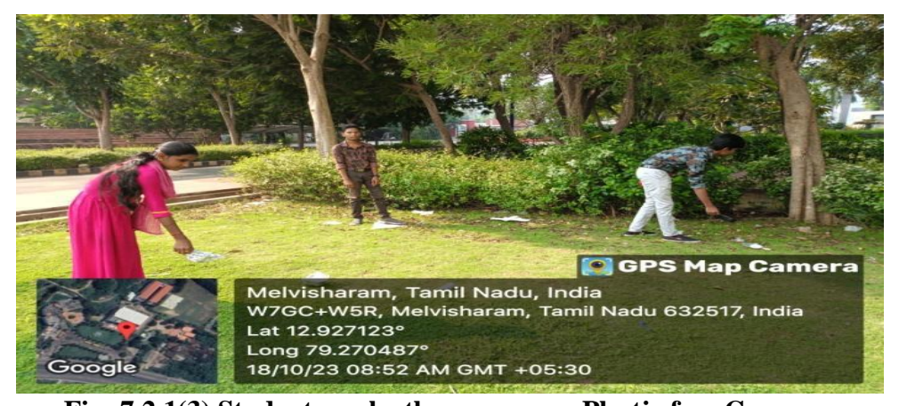
Fig: 7.2.1(3) Students make the campus as Plastic free Campus

The college is continuously committed to working towards a plastic-free campus, as per guidelines of the UGC to impose a ban on single-use plastics in higher educational institutions have been abided by our college. Single-use plastic items such as plastic bottles, bags, spoons, straws and cups are among the banned plastic products. It has been made applicable at the canteen, college premises and hostels. Staff and students are also advised to use metal water bottles instead of plastic ones. We mandate all students/staff members to avoid bringing non-biodegradable plastic items on the campus.