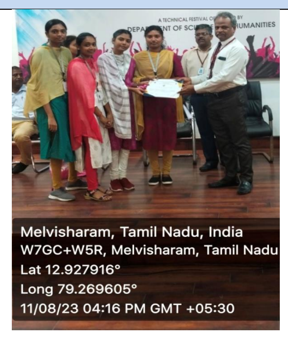
Fig: 7.2.1(10) Winners received awards and appreciation of Best Student Of The Year-2022'