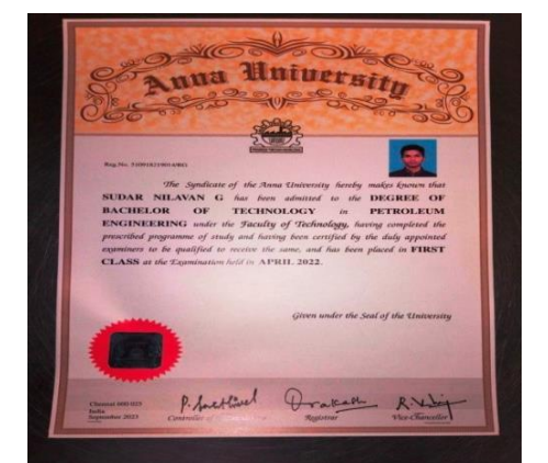
Fig: 7.2.1(24) Winners Appreciated & Received University Certificate