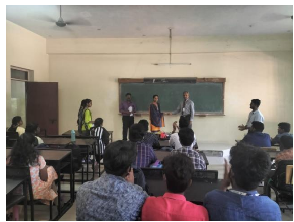
Fig: 7.2.1(16) Winners received awards and appreciation at Classroom