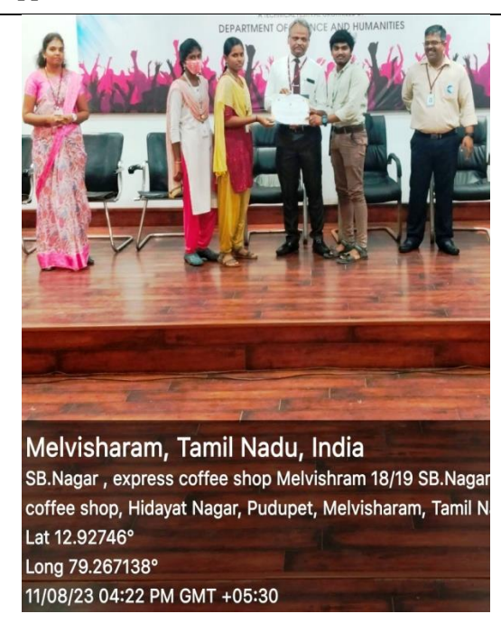
Fig: 7.2.1(8) Winners received awards and appreciation of Best Student Of The Year-2022'