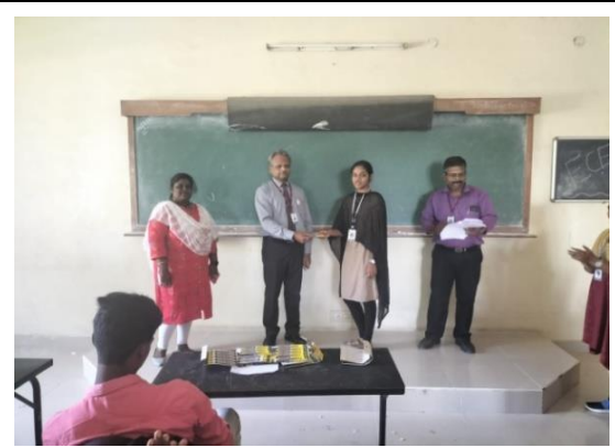
Fig: 7.2.1(19) Winners received awards and appreciation at Classroom